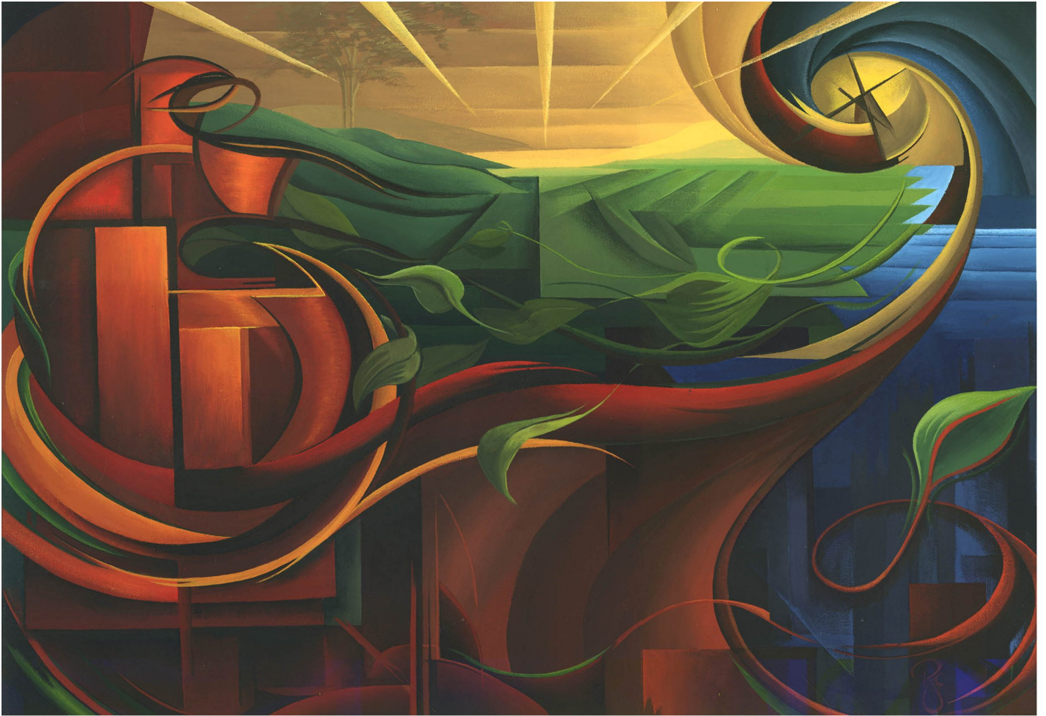
Roselyn Cloake - Windy Morning . 2003 (Acrylic on Canvas)