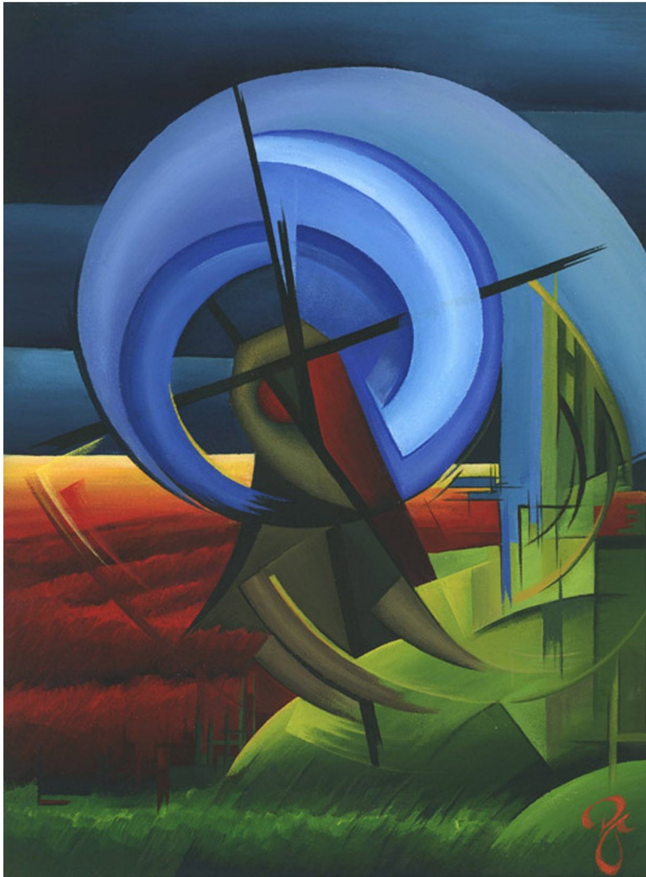
Roselyn Cloake - Molen. 2002 (Acrylic on Canvas)