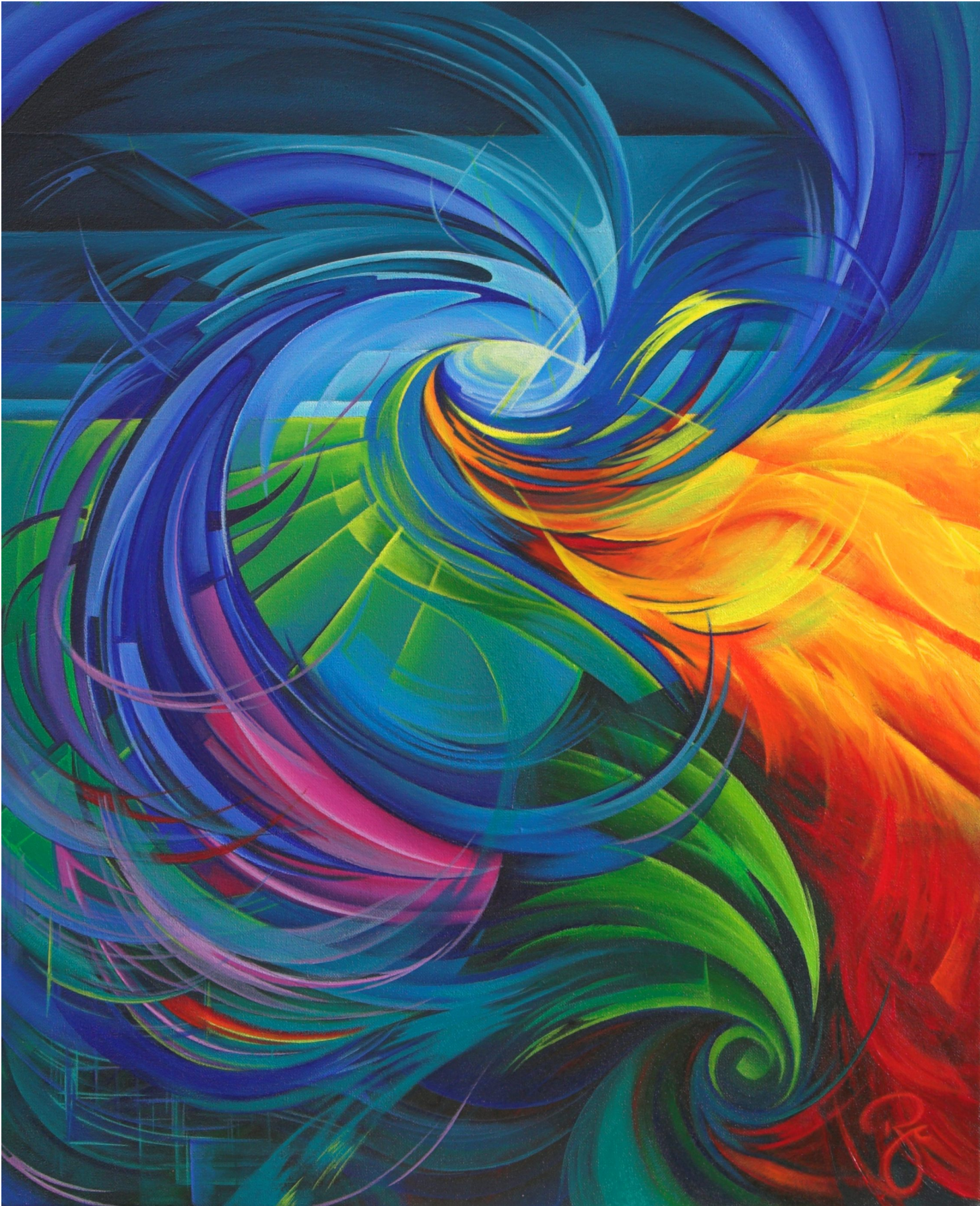
Roselyn Cloake - Spun Series . 2006 (Acrylic on Canvas)