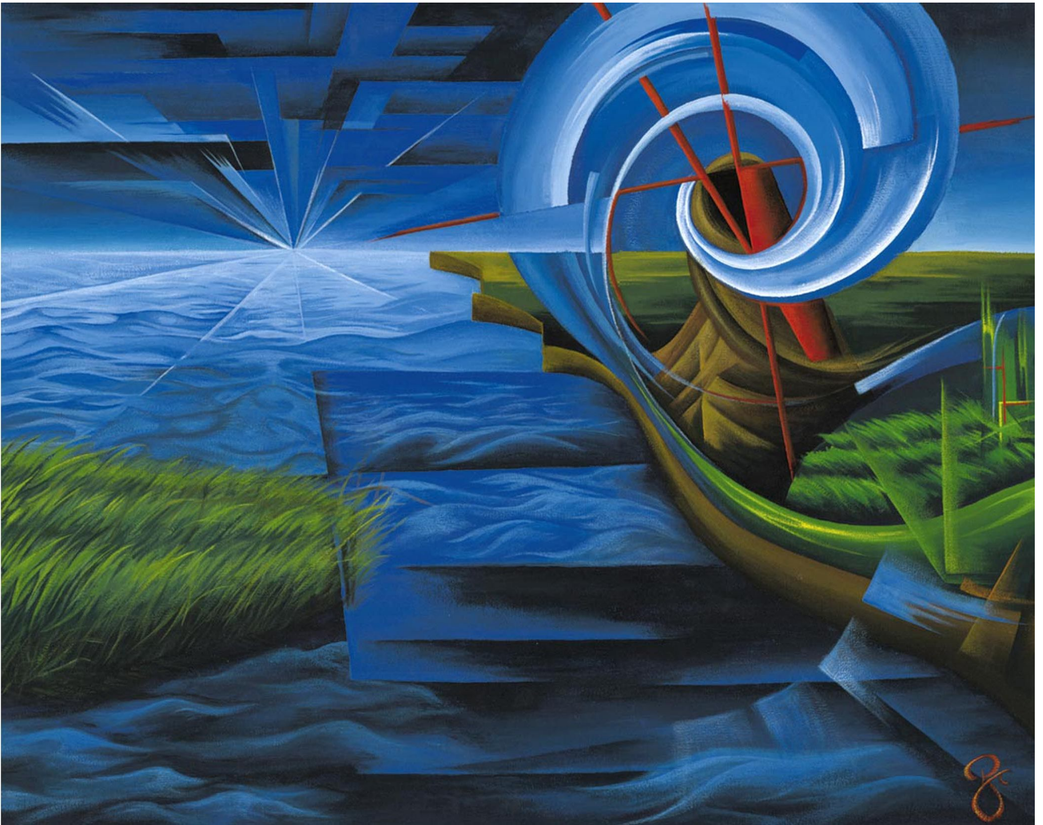
Roselyn Cloake - Wound Landscape Series 2. 2003 (Acrylic on Canvas)