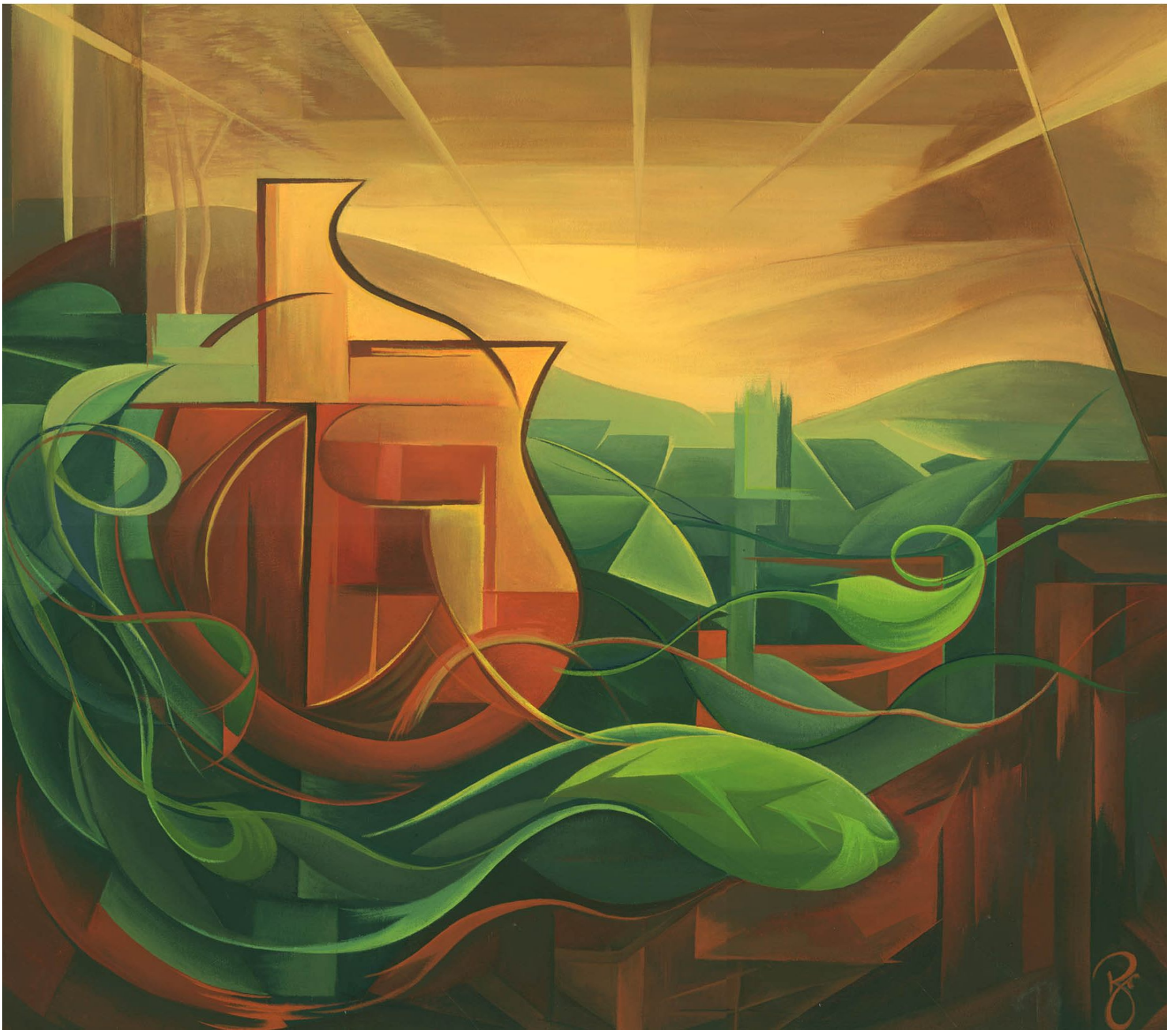
Roselyn Cloake - Windy Acorn Jug . 2002 (Acrylic on Canvas)