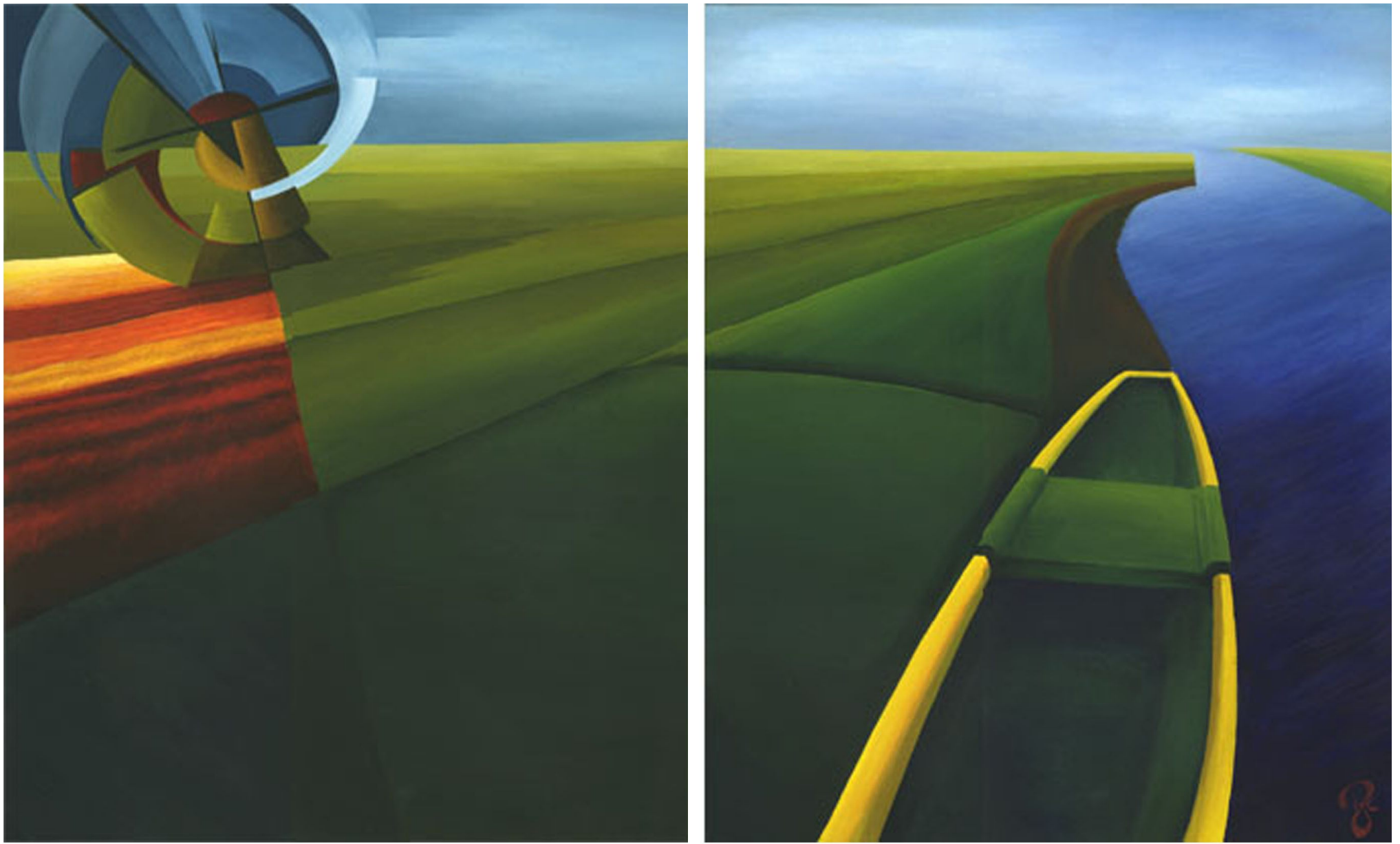
Roselyn Cloake - Canal Boat Series Diptych. 2002 (Acrylic on Canvas)