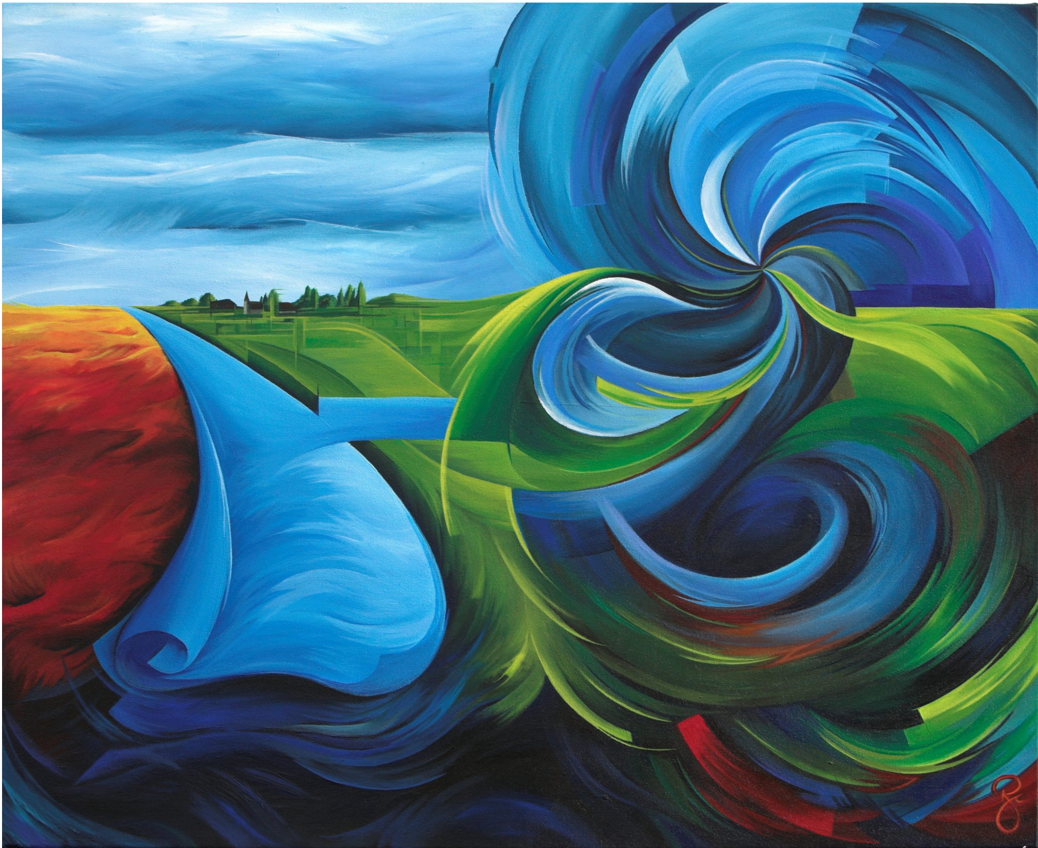
Roselyn Cloake - Wind and Tulips Series #5. 2006 (Acrylic on Canvas)