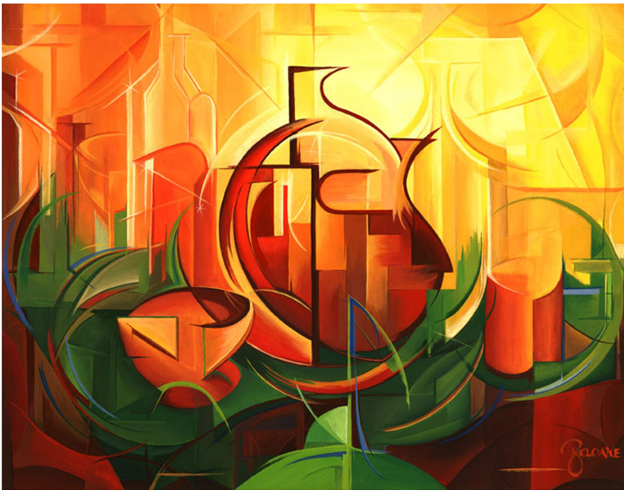
Roselyn Cloake - Still Life . 2002 (Acrylic on Canvas)